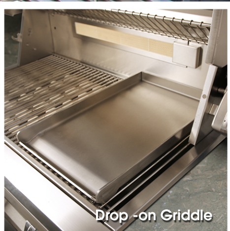
Drop -on Griddle