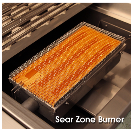
Sear Zone Burner

Buy any Artisan or Artisan Professional Series grill, and get your choice of a griddle or a sear zone burner FREE!*